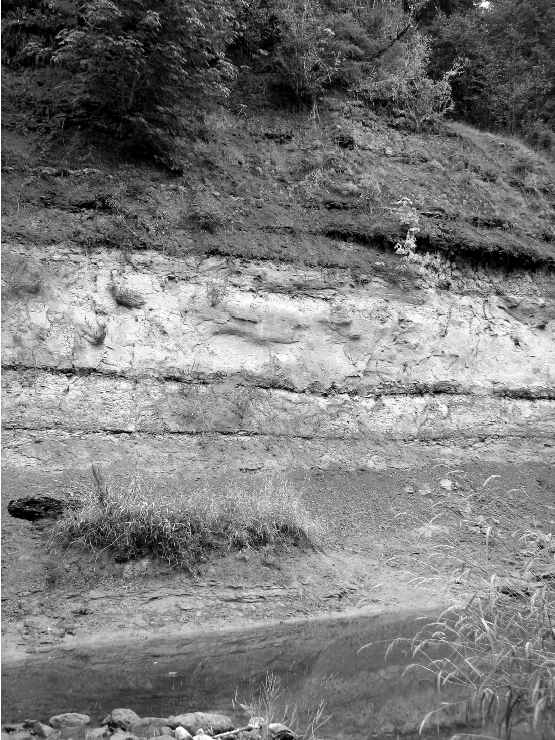
Late Miocene Wilkes Formation strata exposed along Salmn Creek