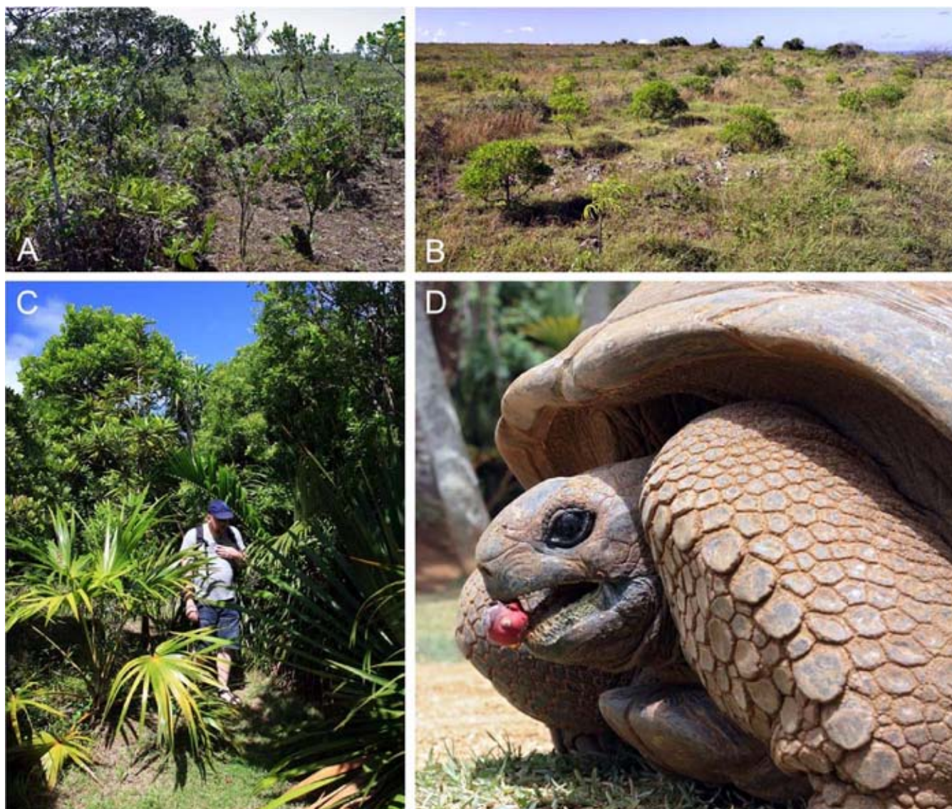
Fig. 2. Restoration of plant–animal mutualisms on oceanic islands. Options for restoring native pollination and seed dispersal interactions are manifold. They include weeding or eradicating alien invasive species, as well as actively facilitating increases in populations of native species, or even replacing extinct species with taxon substitutes. For example, while manual weeding of introduced and invasive plant species in restoration areas in Mauritius creates a lot of initial disturbance (A; compare right-hand side, weeded area with left-hand side, unweeded area), it rapidly results in an increase in interactions between native plants and native flower visitors, compared to non-weeded areas (Kaiser-Bunbury et al., 2009). On extremely degraded islands, such as Rodrigues in the Indian Ocean, another option is to recreate native habitats from scratch. Here, in the Francois Leguat Reserve, some 100,000 native seedlings have been planted in 2007 (B). In another conservation area on Rodrigues, Grande Montagne, similar plantings in 1998 have already resulted in a low forest of 3–6 m in height (C), with many plants already flowering and producing fruits. A next logical step would be to rewild such habitats with taxon substitutions, replacing extinct endemic frugivores with extant analogues, for example Aldabra giant tortoises Aldabrachelys gigantea to replace the two extinct Cylindraspis giant tortoises (D).

Marsh and Trenham, 2008). One reason may be that species richness and populations are simply easier to quantify than ecological interactions. However, to more fully encapsulate ecosystem health it is pivotal to monitor changes to the underlying biostructure instead of only monitoring species diversity patterns (McCann, 2007). We here argue that plant–pollinator interactions, specifically flower visitation rates and the resulting reproductive success of plants, represent a comprehensible and easily quantifiable way of monitoring a vital part of the biostructure of an ecosystem. Alternatively, determining pollen limitation is a suitable method to monitor pollination effectiveness, and it can easily be demonstrated empirically when supplemental pollination of flowers increases their seed and fruit set compared to open-pollinated controls. Combining the monitoring of the interactions themselves and their outcome, i.e., seed production and dispersal,